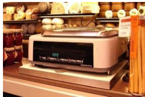
Weigh Scale Labels