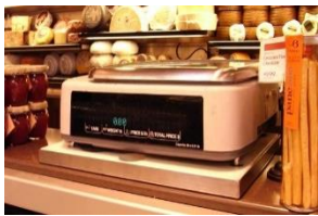
Weigh Scale Labels