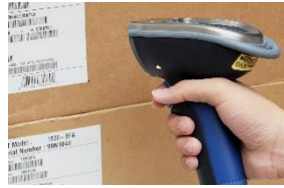
Postal & Shipping Labels