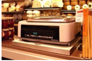
Weigh Scale Labels