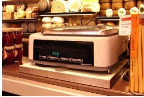
Weigh Scale Labels