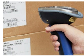
Postal & Shipping Labels