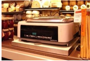
Weigh Scale Labels