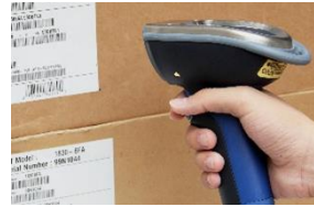
Postal & Shipping Labels