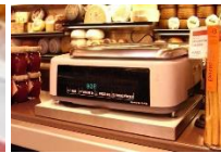
Weigh Scale Labels