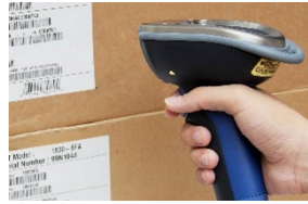
Postal & Shipping Labels