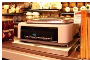
Weigh Scale Labels