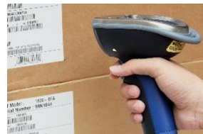
Postal & Shipping Labels