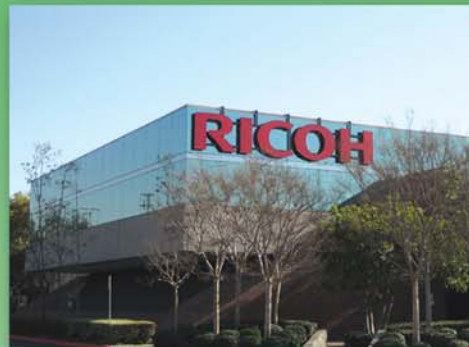
Tustin Building No.1 Systems Production HQ and Copier Production Operation Footage: 146,125 sq. ft.