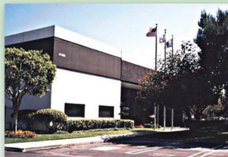
Irvine Building No.1 Manufactured Parts and Injection Mold Parts Manufacturing Operation Footage: 100,000 sq. ft.