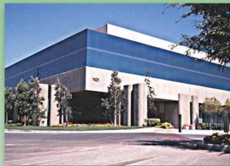
Tustin Building No.2 Printed Circuit Board Assembly Remanufacturing and Custom Configuration Center Footage: 172,333 sq. ft.